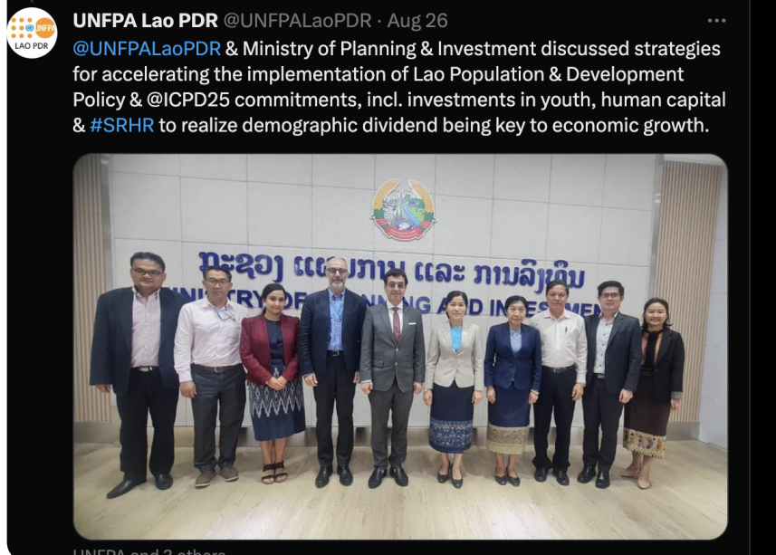
UNFPA and 3 others

UNFPA Representative met with the Vice Minister of Planning & Investment to explore ways of taking stock of the progress in the implementation of Lao PDR's Population & Development Policy (2019-2030) & ICPD25 commitments in support of the 9th NSEDP.