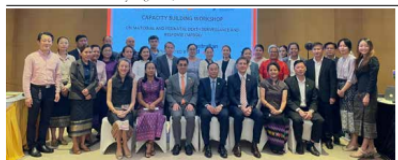
UNFPA and health ministry officials gather at a regional capacity-building workshop.