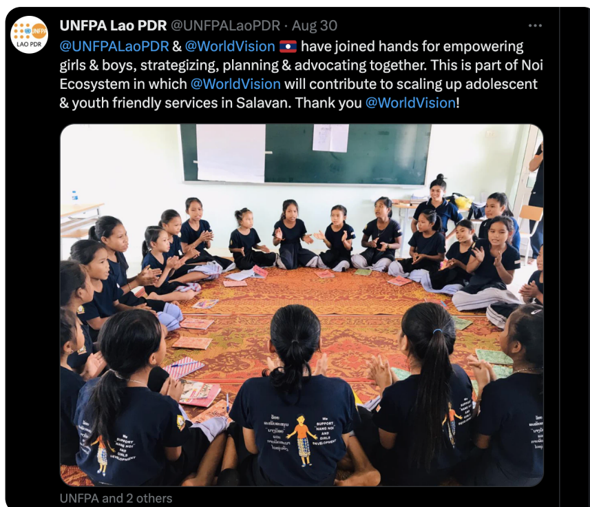
UNFPA and 2 others

UNFPA and World Vision Laos signed a memorandum of understanding to join efforts aiming to advance access to Adolescent Youth Friendly Services. World Vision will use their own funds to integrate in their ongoing projects, AYFS interventions using the standards and guidelines developed by UNFPA and the Ministry of Health.