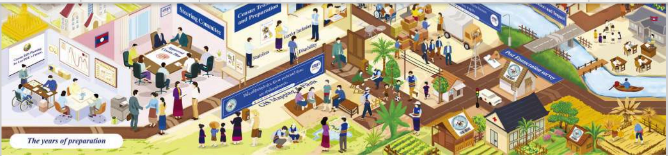
The years of preparation