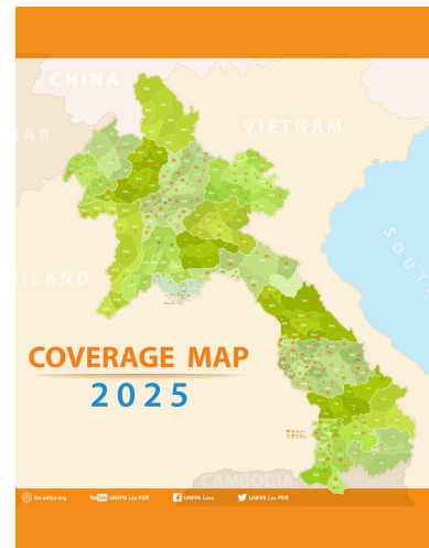
UNFPA Coverage Mapping in Lao PDR 2025