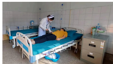
Breaking the Cycle of Gender-Based Violence in Lao PDR