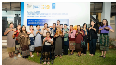
Discover the Stories of 17 Inspiring Women Wearing Tui's Hat to Claim the Right to Work and Thrive