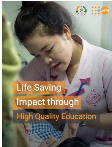
Life Saving Impact through High Quality Education