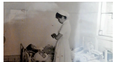
Heroes in Pink: Celebrating the Legacy and Future of Midwifery in Lao PDR