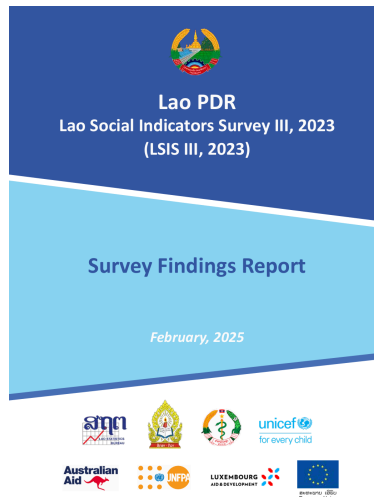
Lao Social Indicator Survey III (LSIS III), 2023