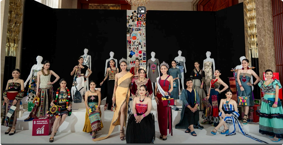
Celebration of World Population Day 2024 in Lao PDR: weaving the promise to end inequalities

Overall, the event underscored the significance of World Population Day in raising awareness about national progress, sharing success stories , and learning from best practices to expedite the ICPD Programme of Action.