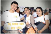
The Lao Youth Union (LYU) and the United Nations Population Fund (UNFP) marked International Youth Day with a series of activities for young people from across Laos under the theme 'From Clicks to Progress: Youth Digital Pathways for Sustainable Development'.

The event was attended by officials and youth representatives, emphasizing the intersection of digital technology and the Sustainable Development Goals (SDGs).